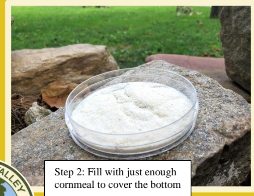
Step 2: Fill with just enough cornmeal to cover the bottom