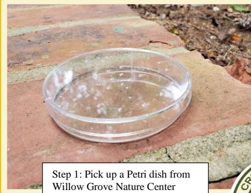
Step 1: Pick up a Petri dish from Willow Grove Nature Center