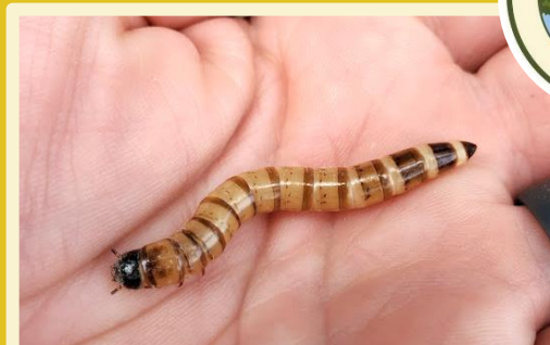
Step 3: Along with your petri dish, make sure you get a super worm from the Nature Center! Don't forget to give your Mealworm a name!