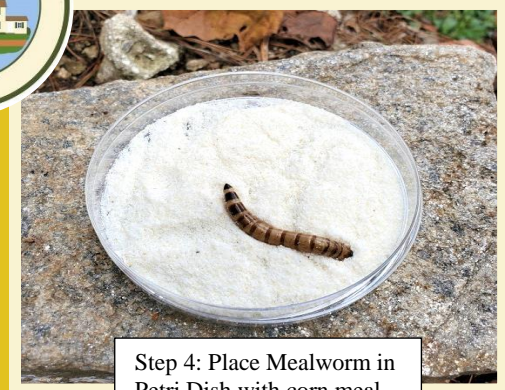
Step 4: Place Mealworm in Petri Dish with corn meal.